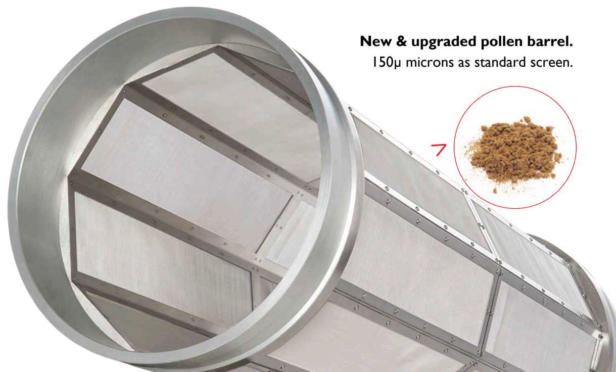
New & upgraded pollen barrel. 150µ microns as standard screen.