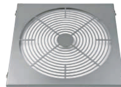
Stainless steel grid (without paints)