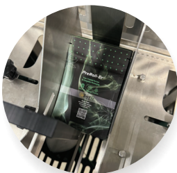
Various Bags Sizes

The machine is adaptable to all sizes of pre-rolls and bags.