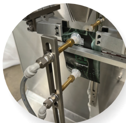
Vaccum Opening Sensor